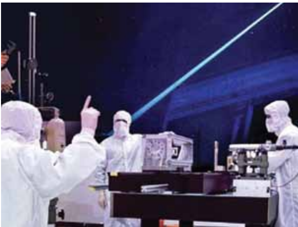
Northrop Grumman's AOA Xinetics is a leader in the design, simulation and production of high-performance, computer-aided, electro-optic systems and subsystems.