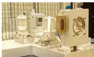
Small, medium or large volume manufacturing services

Design, manufacturing, and support for government customers