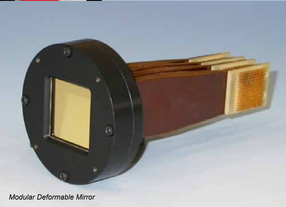
Modular Deformable Mirror

Contract optical design, software development, and manufacturing for commercial and government customers