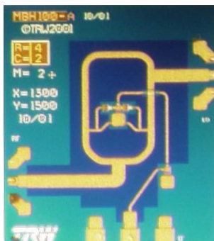
X=1300 \mu m Y=1500 \mu m