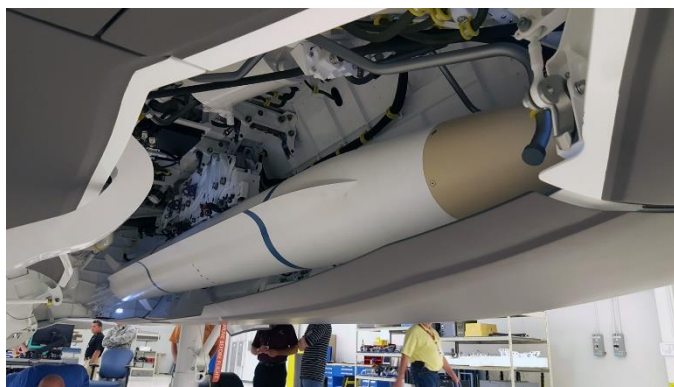
AARGM-ER fit check in F-35 weapons bay