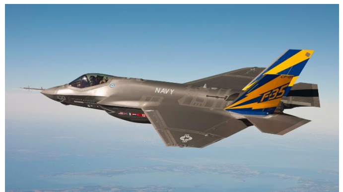
Expands Future Capability with F-35 Lightning II