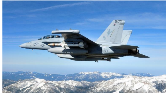
Improves Current Capability of F/A-18 Super Hornet and E/A-18 Growler