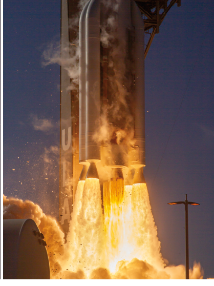
Atlas V launch